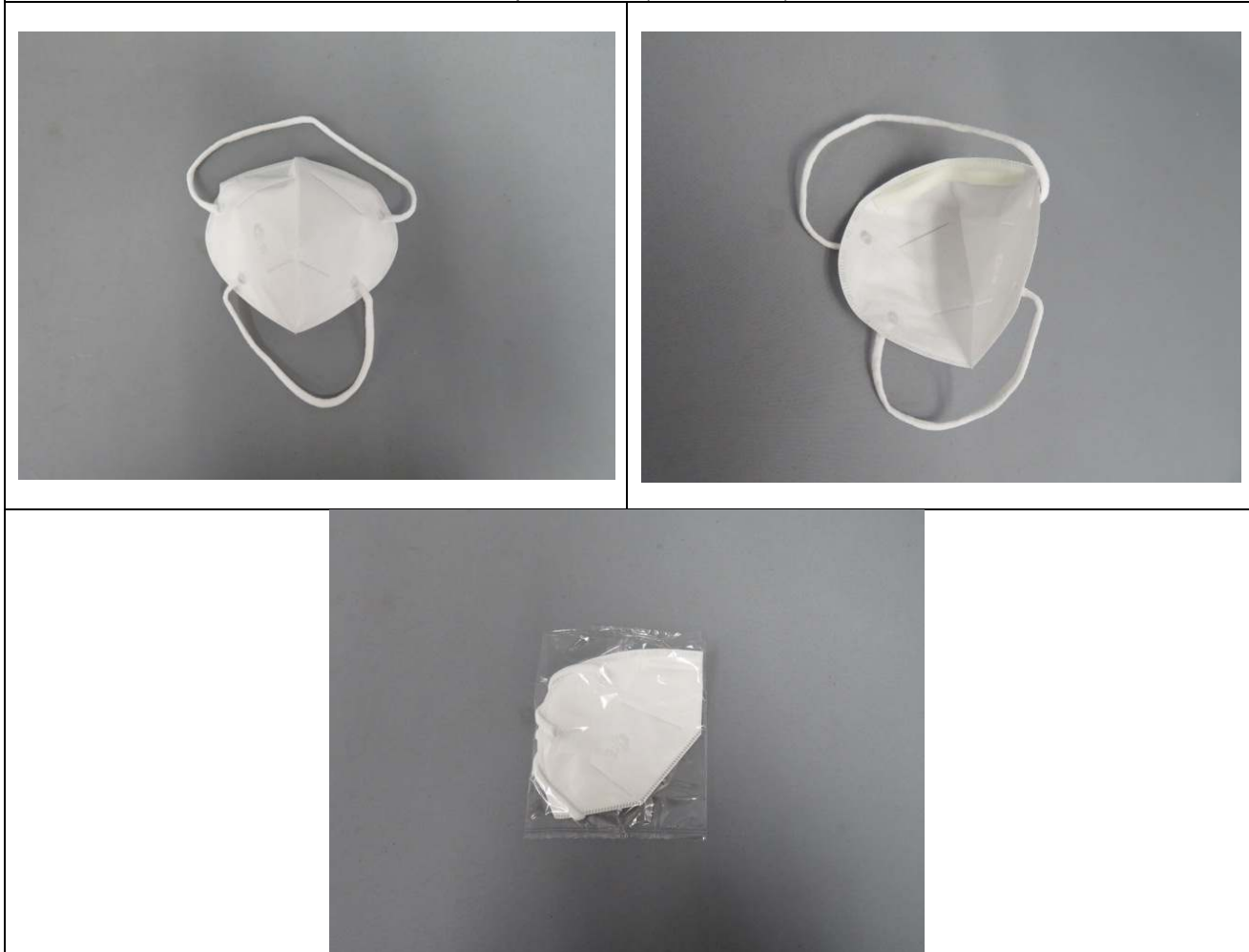
Sample Picture (As received)

SGS authenticate the photo on original report only